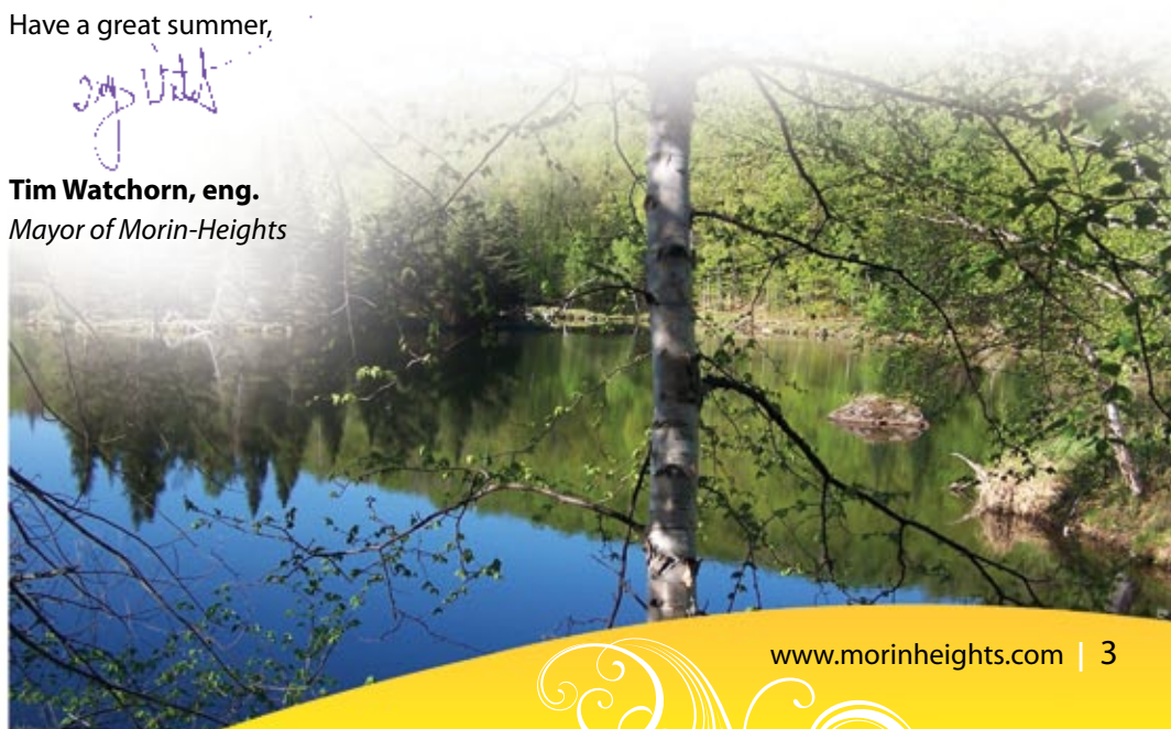
Tim Watchorn, eng. Mayor of Morin-Heights

The number of road work sites is very high throughout Quebec. During your vacation or simply before leaving, plan your route by consulting the Info Transports website at: